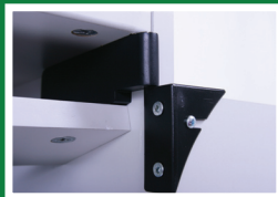
180 Degree nylon hinge for unobstructed collection