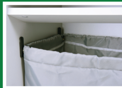
Nylon bag hooks makes bag fit tight. No paper misses the bag.